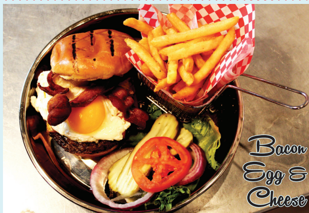
Bacon Egg & Cheese

Prime Rib Dip WHEN AVAILABLE $14.99 TENDER PRIME RIB SERVED ON A WARM BUN WITH AU JUS