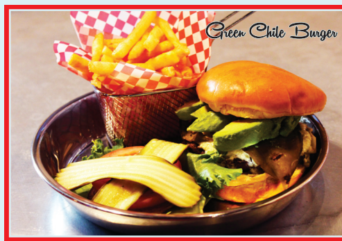
Green Chile Burger

Beyond™ Burger $15.99 CRUISER'S CLASSIC BURGER USING A 6oz MEATLESS BEYOND BURGER PATTY WITH CHOICE OF CHEESE - $17.99