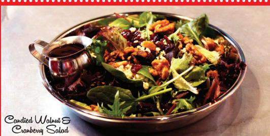
Candied Walnut & Cranberry Salad

RANCH | BLEU CHEESE | 1000 ISLAND | CAESAR | ITALIAN | HONEY MUSTARD | RASPBERRY VINAIGRETTE | OIL & VINEGAR